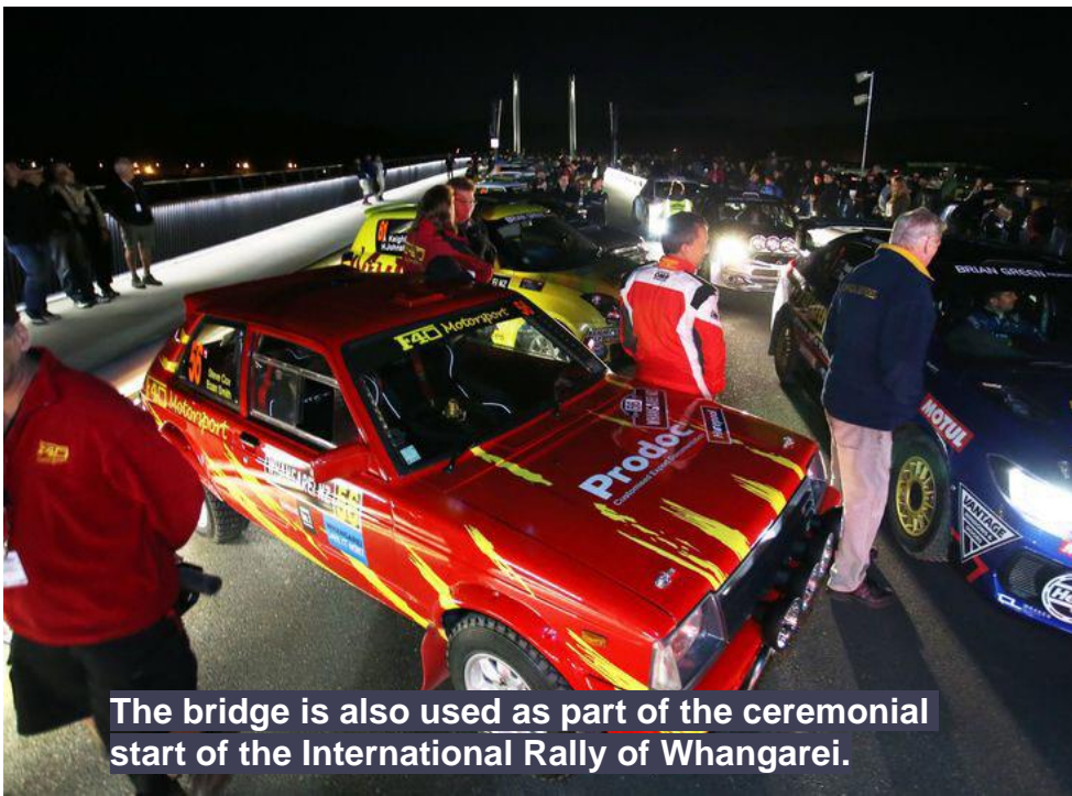
The bridge is also used as part of the ceremonial start of the International Rally of Whangarei.