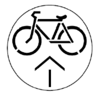
STRAIGHT AHEAD ARROW