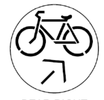
BEAR RIGHT ARROW