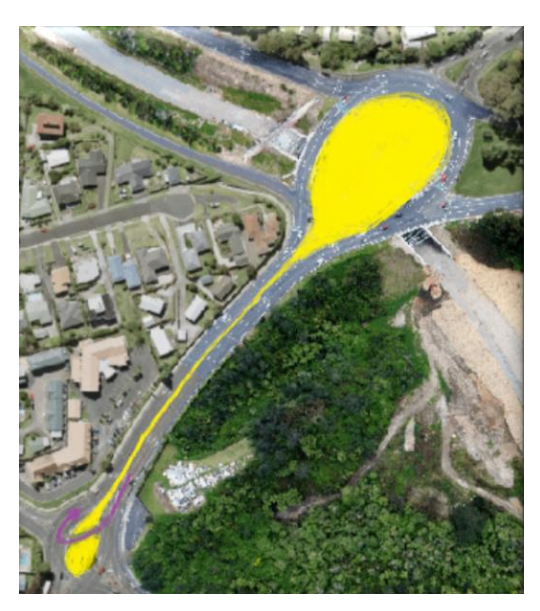
Elizabeth St roundabout metering deemed a success