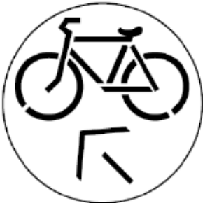
BEAR LEFT ARROW