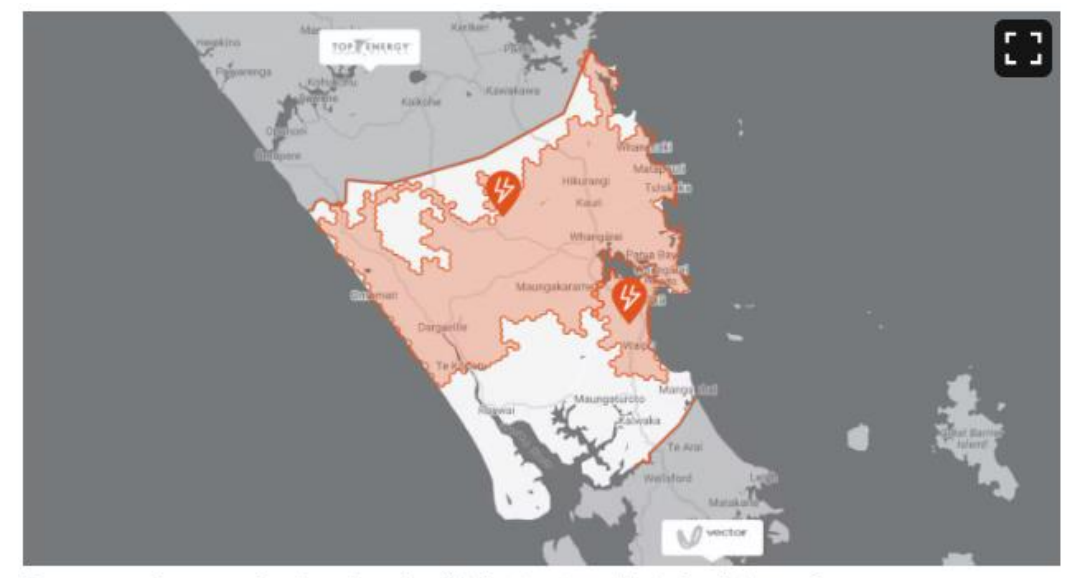
Transpower is assessing how long it will take to return that circuit to service.

At that point in time there was a real risk of rolling blackouts and so it was critical to start thinking about more equipment and fuel.