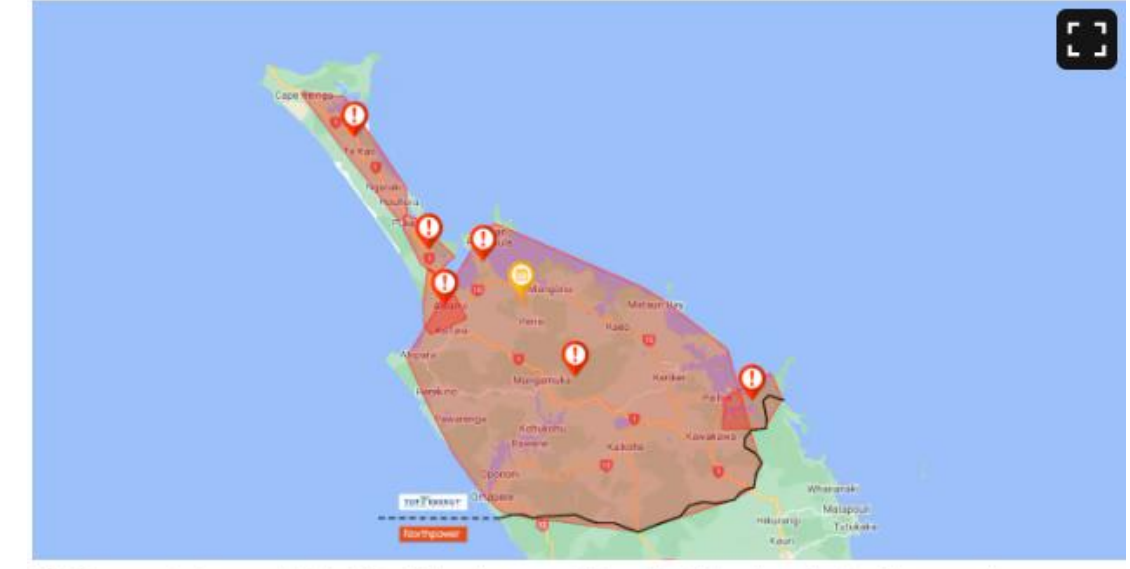
NZ Transport Agency Waka Kotahi has been advising Northlanders that widespread power outages were affecting traffic signals on both local roads and state highways.